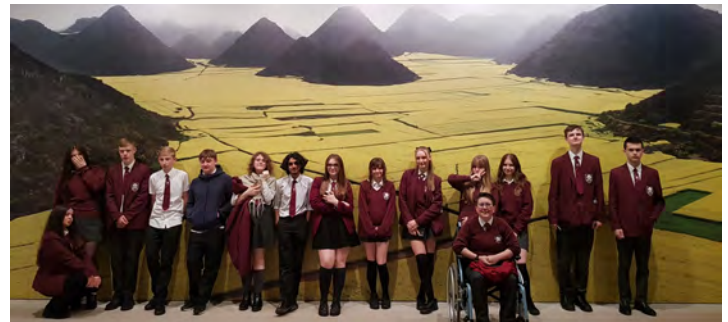
Students pictured in front of Canola Fields, 2011

All students were involved in a recycling workshop designed to highlight the impacts and possible solutions for fast-fashion. The workshop linked to the messages highlighted by Burtynsky in the exhibition: Extraction.